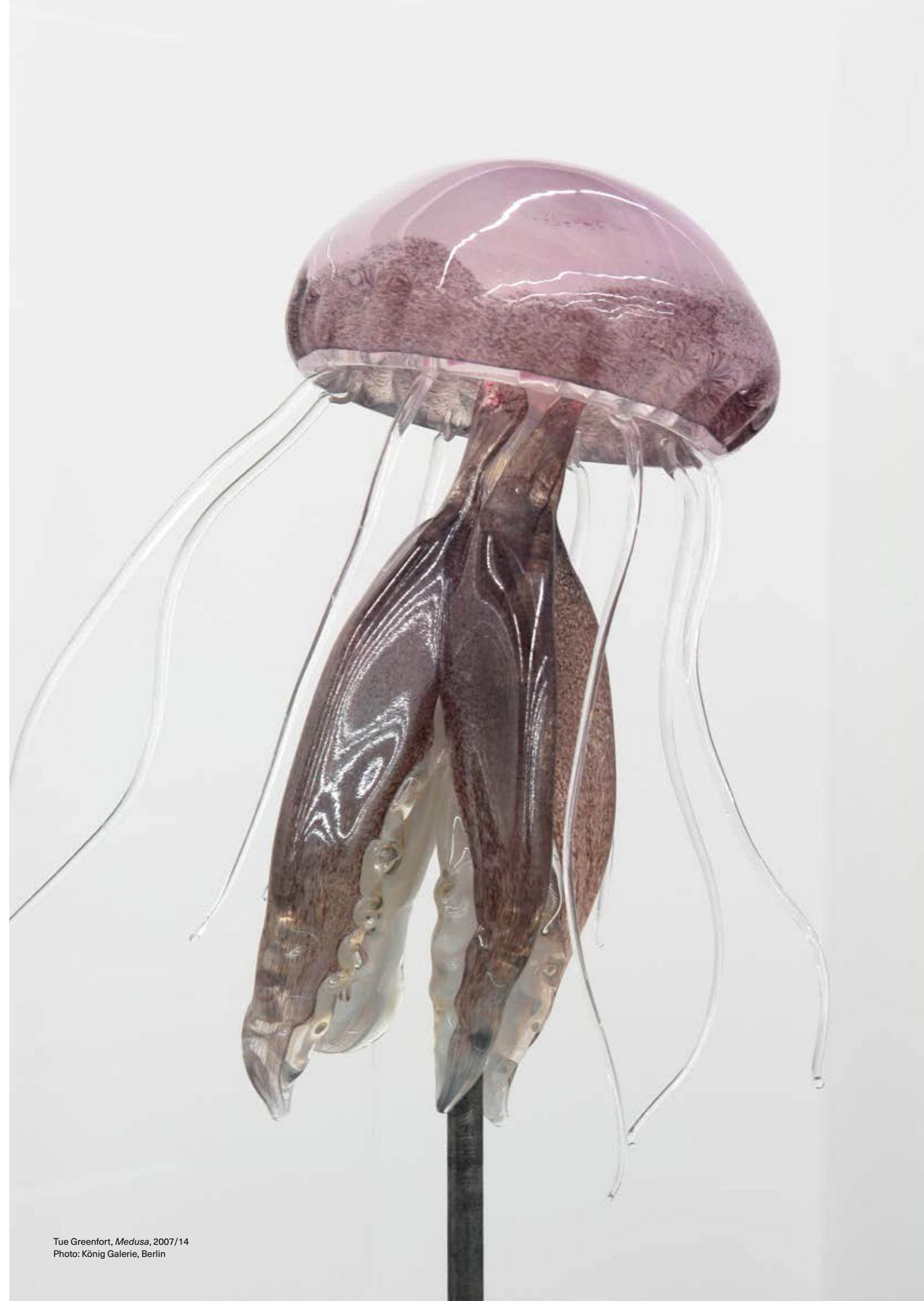
Tue Greenfort, Medusa , 2007/14

Further information: https://fondazioneprada.org/project/human-brains-it-begins-with-an-idea/