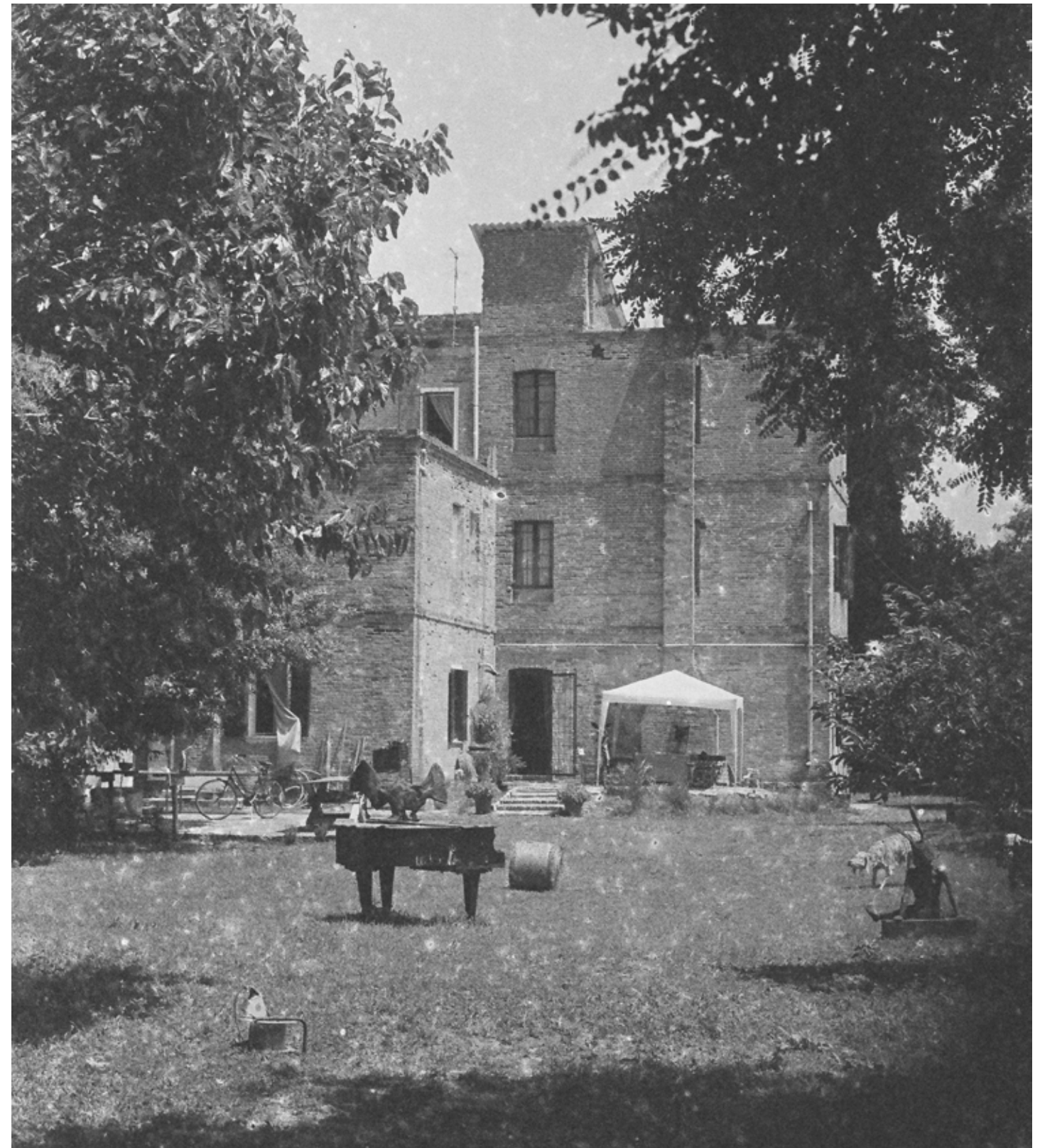
View of MetaForte, Cavallino-Treporti