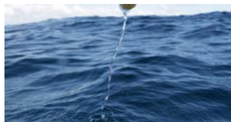
Dineo Seshee Bopape, Film still , 2021-22 The Soul Expanding Ocean #3: Dineo Seshee Bopape is commissioned and produced by TBA21-Academy

Introduction to the activities of Ocean Space and visit of the exhibitions The Soul Expanding Ocean #3: Dineo Seshee Bopape and The Soul Expanding Ocean #4: Diana Policarpo