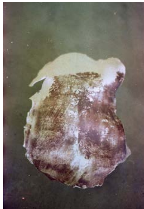
Delphine Wibaux, Témoin souple , 2014.