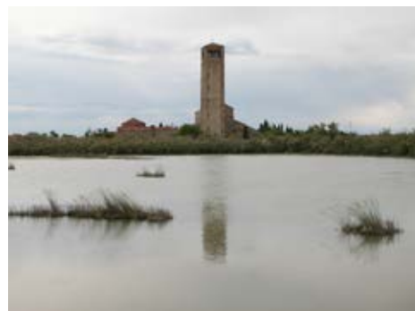
View of Torcello

Visit to the archeological site of Torcello with Marco Paladini