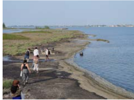
Image of Lo Stivale , experiential walk led by Barena Bianca in Sant'Erasmus, as part of Piantagrùel - Deep Feelings , 2022.

Visit to the wetlands with Barena Bianca